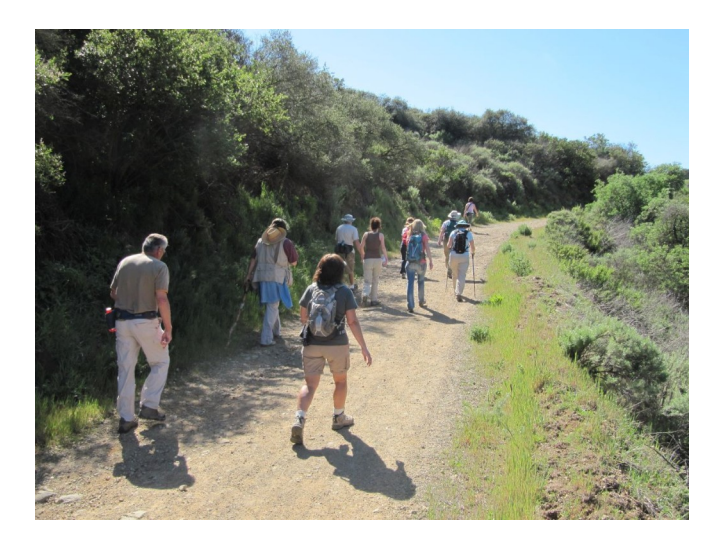
Los Robles Overlook