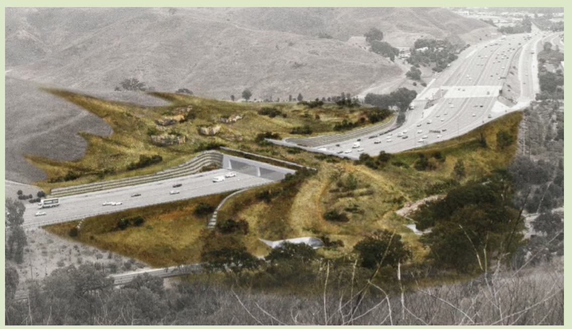
An artist's rendering of the Liberty Canyon Wildlife Crossing that wil span 10 lanes of the 101 freeway and provide safe passage to a variety of mammals, reptiles, and birds.